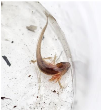
Smooth Newt juvenile