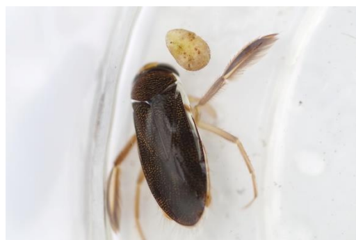
Lesser Water Boatman