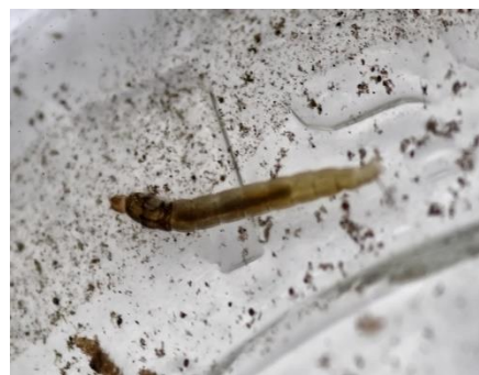
Water Beetle larva