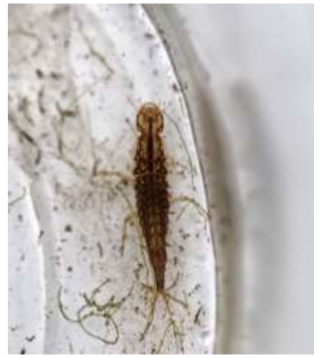
Water Beetle nymph