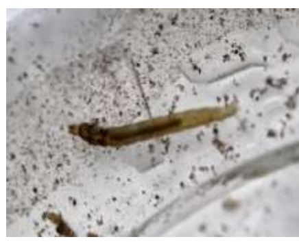
Water Beetle larva