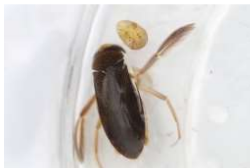
Lesser Water Boatman