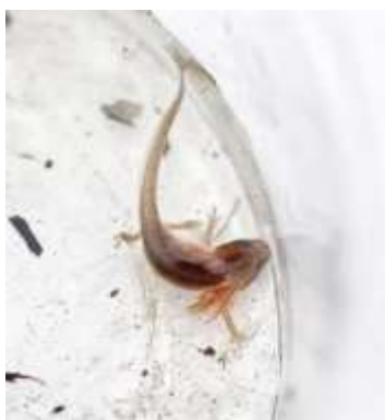
Smooth Newt juvenile